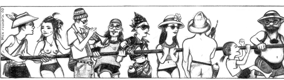
"Hmm, should I go for her, or that Ranger man?

The theme camp member was taken away in a calm and orderly fashion by Sheriff's personnel to an undisclosed location for questioning about the alleged assault.