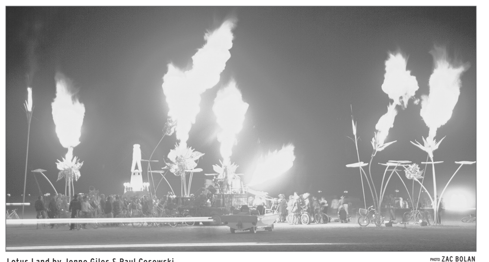
Lotus Land by Jenne Giles & Paul Cesewski

The phenomenal and plentiful art along with the obviously dedicated artists spring quickly to mind whenever i attempt to describe Burning Man to non-burners (or as of yet nonburners). It is one of the greatest gifts BRC offers to its citizens. 👁