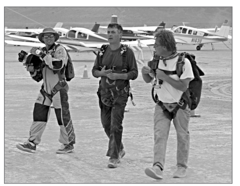
Hatless, harnessed, and ready to go.

In the mean time, visit the BurningSky website to see more aerial photos and video of the Human Man and other images from the SkyPeople. Their aerial video footage is also featured in Bill Breithaupt's 2002 Burning Man film "Aqua Burn". The SkyPeople continue to request any video footage and stills taken of their work to be donated to what has already been collected. If you have any images to share, please contact them.~